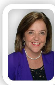
Your Church Music Director

Each Office is Independently Owned and Operated.