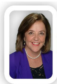
Your Church Music Director

https://www.presentationministries.com/series/obob/obob-2021-10-13-en