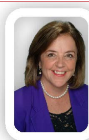
Your Church Music Director

Each Office is Independently Owned and Operated.