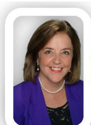
Your Church Music Director

ADVERTISE WITH US! Contact our bulletin editor: tahoecatholicbulletin @ gmail.com