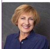
Parish Council Secretary