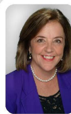
Your Church Music Director