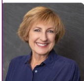
Parish Council Secretary

VÍA CRUCIS El Vía Crucis en español es los viernes de Cuaresma a las 7pm en la iglesia.