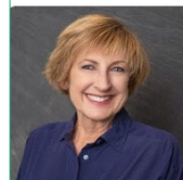
Parish Council Secretary