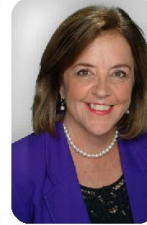
Your Church Music Director