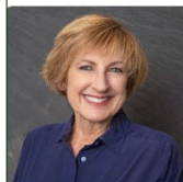
Parish Council Secretary