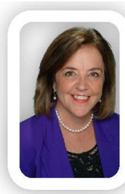
Your Church Music Director

Estate Planning and Real Property attorney serving Lake Tahoe. Call for a free consultation.