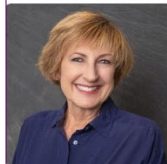
Parish Council Secretary

READINGS FOR THE WEEK | https://bible.usccb.org/daily-bible-reading