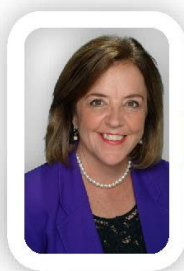
Your Church Music Director

SIGN UP FOR FREE! sainttheresasouthlaketahoe. formed.org Use the Parish code: QKK7X3 (All capital)