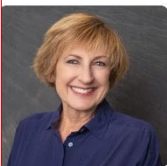
Parish Council Secretary

Estate Planning and Real Property attorney serving Lake Tahoe. Call for a free consultation.