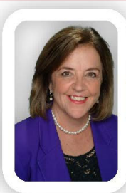
Your Church Music Director

Each Office is Independently Owned and Operated.