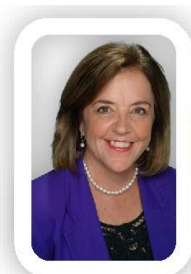
Your Church Music Director

Bulletin content may be changed without notice and is not guaranteed to be complete, correct, timely, current or up-to-date. Similar to any printed materials, content may become out-of-date. Please email tahoecatholicbulletin@gmail.com for questions.