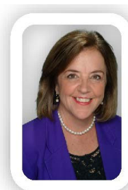
Your Church Music Director

https://www.presentationministries.com/series/obob/obob-2021-10-24-es