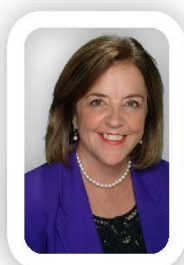
Your Church Music Director

Use the Parish code: QKK7X3 (All capital)