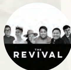
The Revival Band