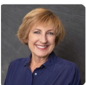
Parish Council Secretary

Estate Planning and Real Property attorney serving Lake Tahoe. Call for a free consultation.