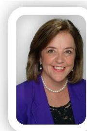
Your Church Music Director

Each Office is Independently Owned and Operated.