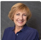
Parish Council Secretary

Estate Planning and Real Property attorney serving Lake Tahoe. Call for a free consultation.