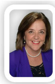
Your Church Music Director

Estate Planning and Real Property attorney serving Lake Tahoe. Call for a free consultation.