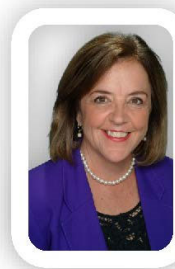
Your Church Music Director

Contact our bulletin editor: tahoecatholicbulletin@gmail.com