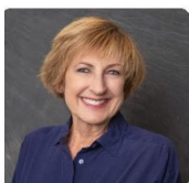
Parish Council Secretary

WE'RE THE GOLD NATION THE #1 REALTOR IN THE WORLD