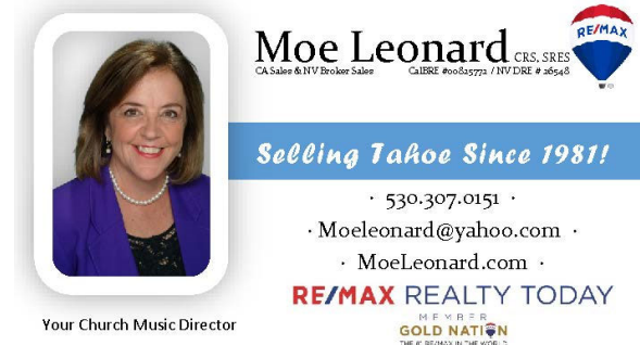
Your Church Music Director