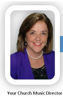
Your Church Music Director